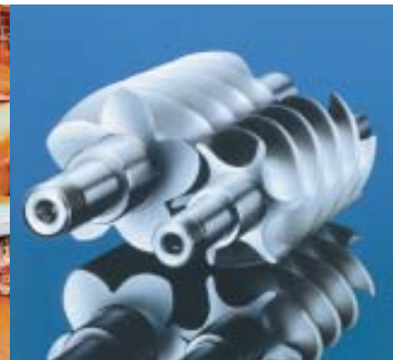
The CompAir screw profile - the result of continuous research and development