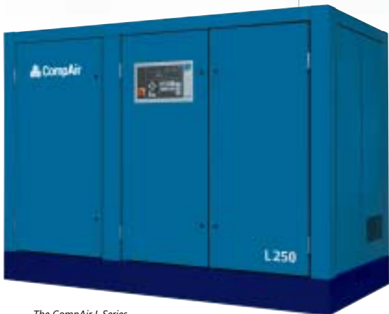
The CompAir L Series. A high capacity air compressor range that sets the highest standards in reliable, economical and efficient operation.

Ongoing investment in the latest design and manufacturing tools, and rigorous implementation of ISO 9001 approved quality systems, ensures you take delivery of a reliable, high quality product.