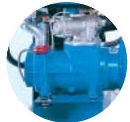
The high capacity compression element, with low rotor-tip speeds, gives high efficiency with maximum reliability