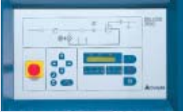
The fully electronic system offers superb performance with simple controls and user-friendly menu