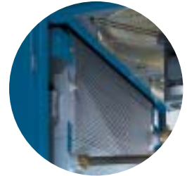
The large aftercooler effectively cools compressed air and is easily accessible for maintenance