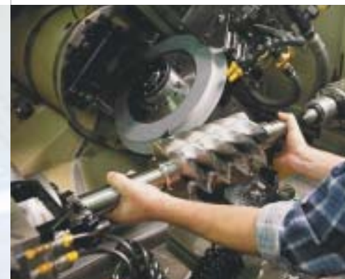
CompAir employs only the very best manufacturing techniques - your guarantee for reliability and performance