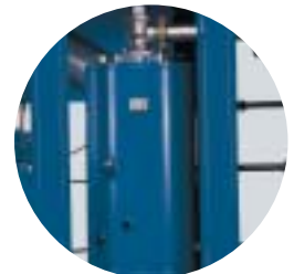
Large reclaimers with generously-sized fine separator elements, large oil coolers and aftercoolers