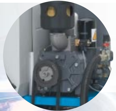
Fully Integrated Design