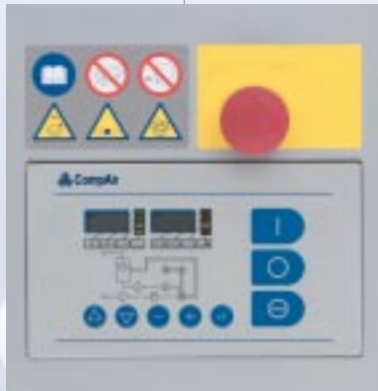
Integrated Control Panel

The control system protects our customers' investment by continuously monitoring operational parameters as well as providing the following features: