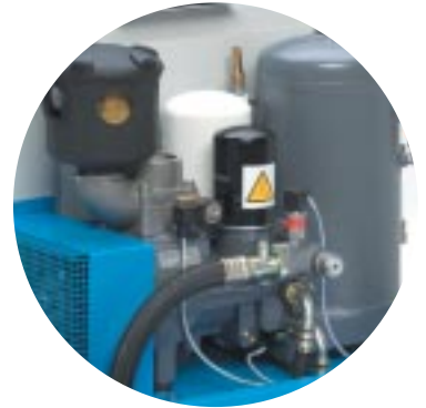
Grouped Service Components

L07 - 22 compressors are available with energy saving high efficiency TEFC electric motors. All motors when coupled with the high specific output CompAir compression elements result in highly energy efficient, high performance compressors.