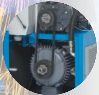
A Reliable and Highly Efficient Drive System